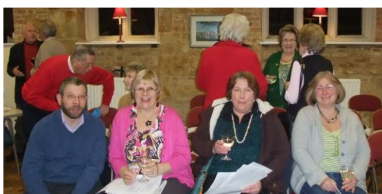
.. while others were more properly restrained